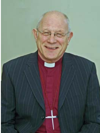
The Rt Revd Peter Price Bishop of Bath & Wells

There are many opportunities for individuals to attend courses run by all kinds of organisations both regionally and nationally. The Individual Allocation Scheme will help to provide access to these.